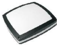
B3230S Square Style