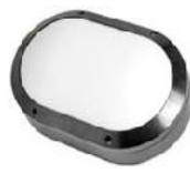
B3220E Ellipse Style