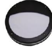
B3230H Semi-Circular Style