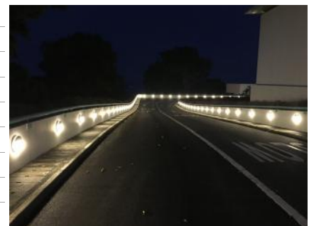
B320 bulkhead being adopted as a guideway lighting for vehicle rampway