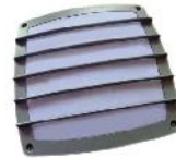
B3230G Square Grid Style