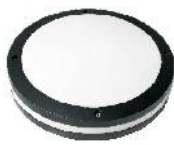
B3230C Circular Style