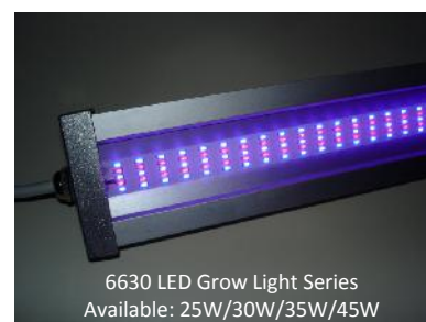
6630 LED Grow Light Series Available: 25W/30W/35W/45W

NOVETE® 6630-H series is high intensity LED grow light designed in elongated shape with standard length of 0.6 and 1.0 meter. The sturdy body structure is made of high grade aluminum material anodized in silver color. The luminaire is IP65 compliant which is also resistance to dust and corrosion.