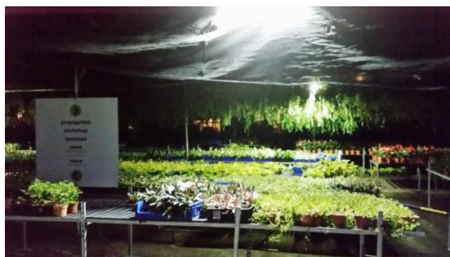
Propagation process of plant and vegetable by 6630H white color grow light

Picture on left exhibits the indoor hydroponic vegetable plant using 6630H compact batten. Light source of the luminaire is deep blue mixed with deep red SMD module complete with built-in driver. It was customized in accordance with the horticulturist's designated spectrum promoting the photosynthesis for plants throughout the vegetative and reproductive growth stages.