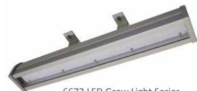
6672 LED Grow Light Series (Available: 60W/80W/100W)