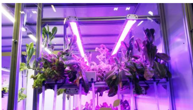
Deep blue and deep red 6630H compact LED batten for indoor hydroponic vegetable plant with good harvesting

Picture on left exhibits the indoor hydroponic vegetable plant using 6630H compact batten. Light source of the luminaire is deep blue mixed with deep red SMD module complete with built-in driver. It was customized in accordance with the horticulturist's designated spectrum promoting the photosynthesis for plants throughout the vegetative and reproductive growth stages.